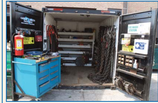
10' RIGGER SEA CONTAINER