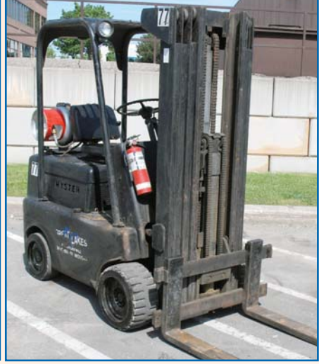
HYSTER 5,000 LB CAP, MODEL S50B