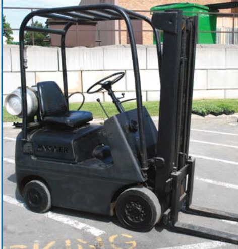
HYSTER 3,000 LB CAP