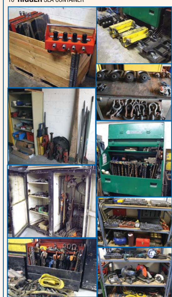
PARTIAL VIEW OF RIGGING SUPPORT EQUIPMENT