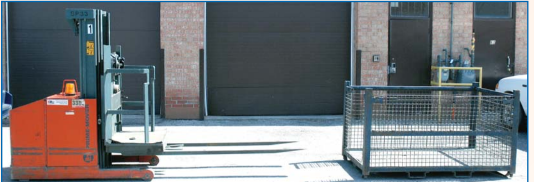
BT LIFT 3,000 LB CAP REACH TRUCK, MODEL 0E35