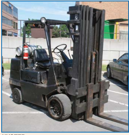
HYSTER 8,000 LB CAP, MODEL S80XL

ALLIS CHALMERS 9,100 LB CAP, MODEL ACC 100 CL PS